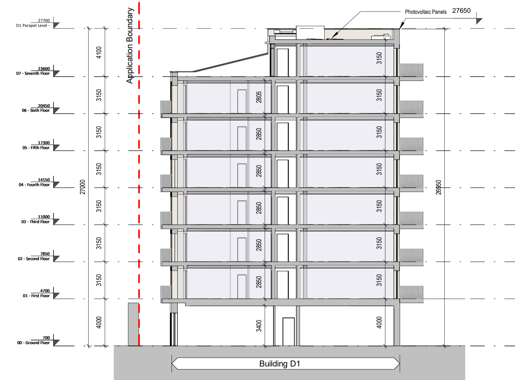
1 D1_Section A-A 1:200