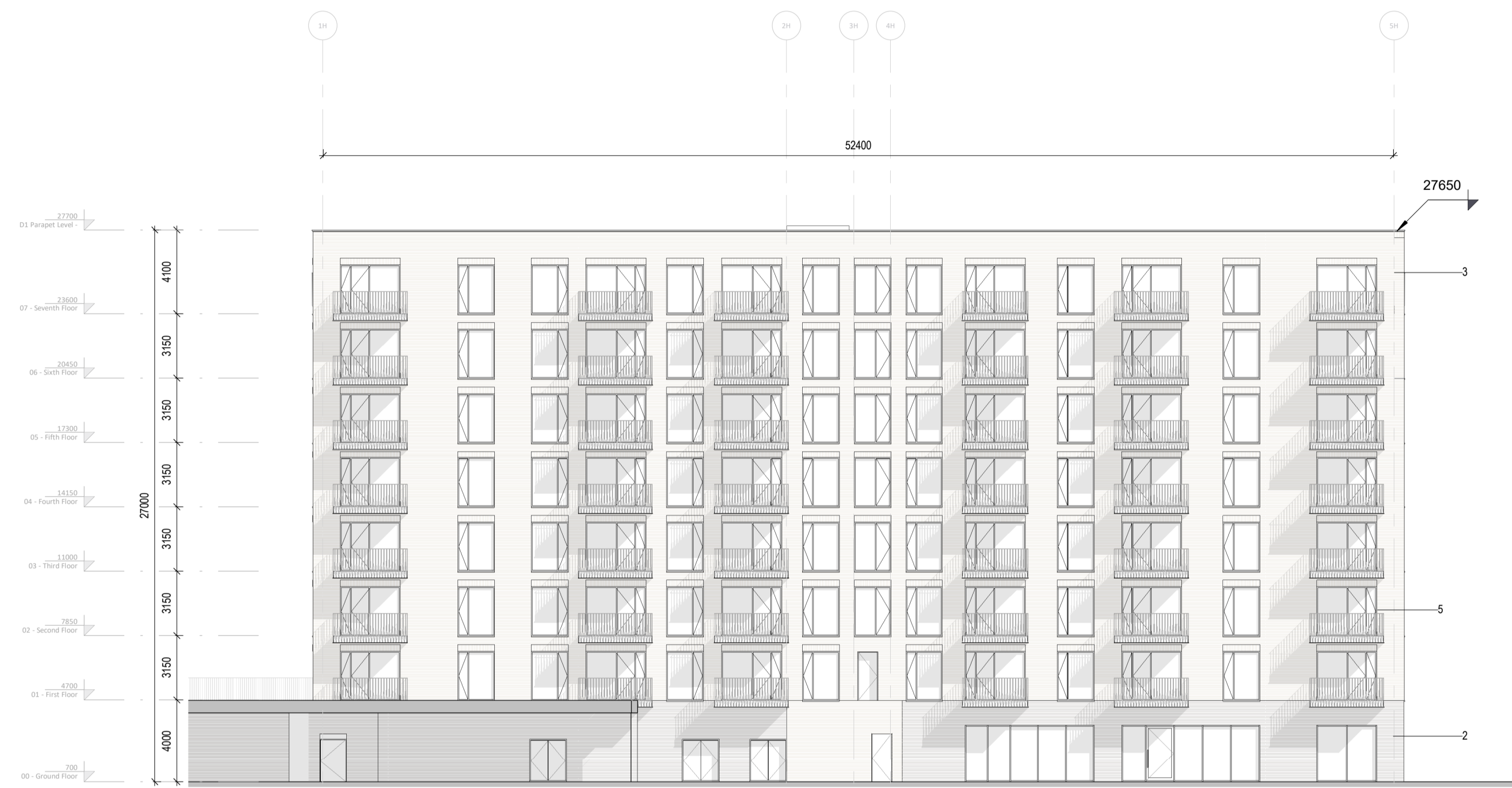
2 D1_South-East Elevation 1:200